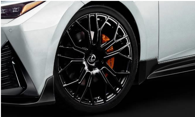
20inch Forged Alloy Wheel “ Melanite Gun Metallic ”