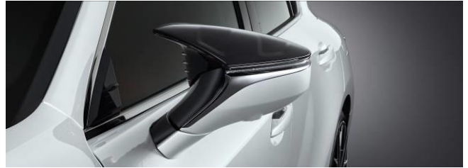
Aerodynamics Mirror Cover