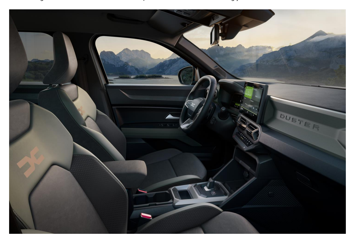
"Duster wouldn't be Duster without a clever and practical interior that makes daily life easier for users. Everything is designed to make you feel at home, front and back." David Durand.

Like the outside, the inside comes with all the essentials – meaning the features that serve a purpose. A lot of work went into the ergonomics, including the 10.1-inch central screen positioned in the driver's field of view and at a 10° angle towards them. The new automatic transmission shifter, coupled with the HYBRID 140 engine, is particularly easy to use. The steering wheel's flattened surfaces at the top and bottom make it exceedingly comfortable to handle.