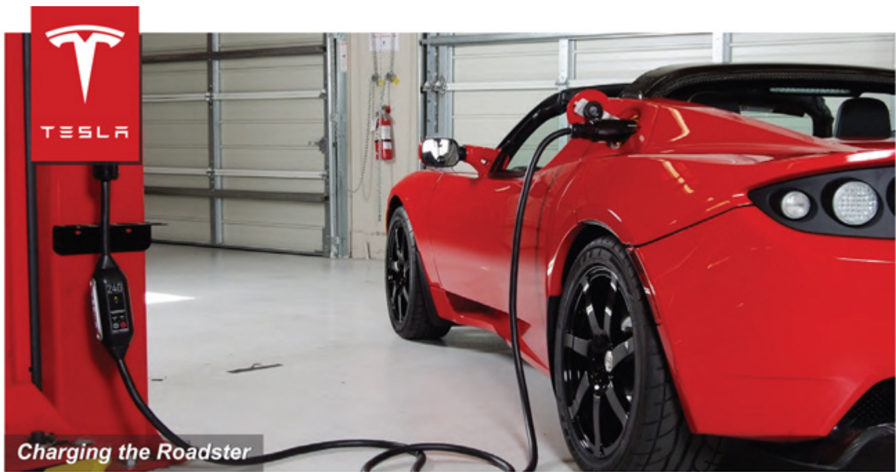
Charging the Roadster