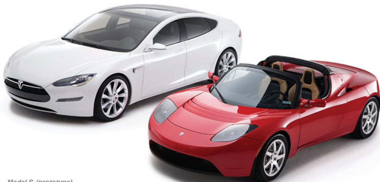
Model S (prototype) planned for 2012