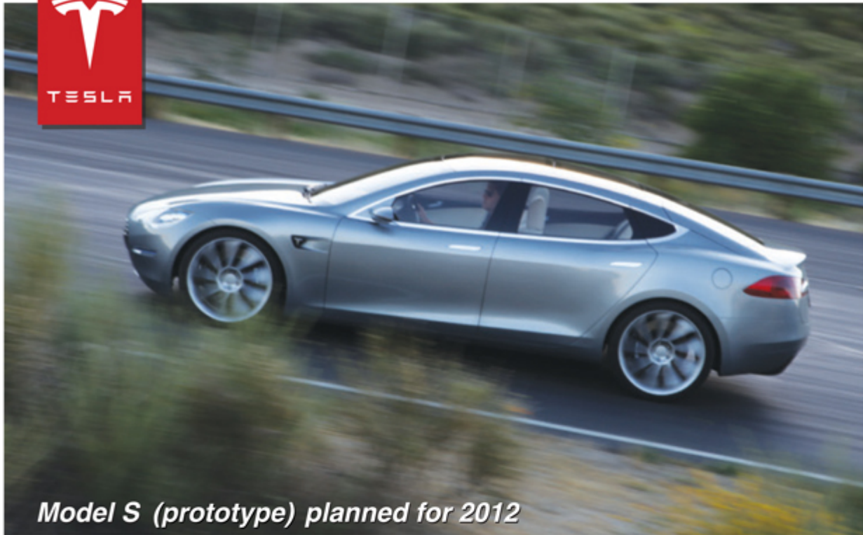
Model S (prototype) planned for 2012