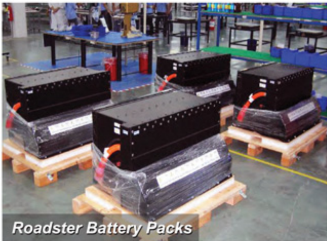
Roadster Battery Packs