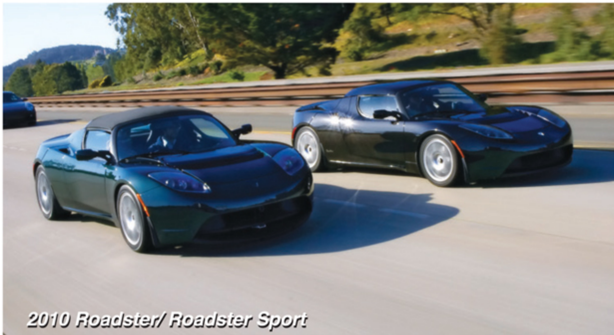
2010 Roadster/ Roadster Sport