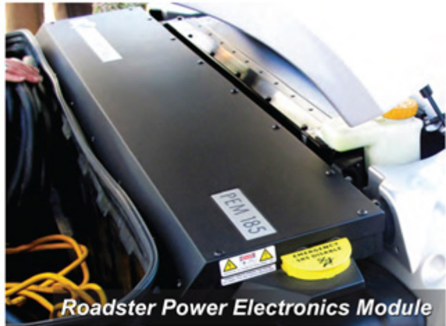
Roadster Power Electronics Module