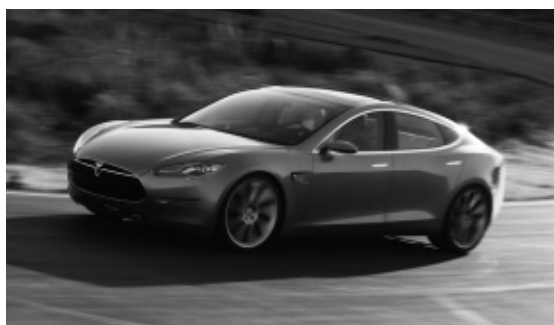
Tesla Model S Prototype

The electric powertrain we developed for the Tesla Roadster has provided the foundational technology for our planned Model S and for electric powertrain components that we have begun selling to Daimler and its affiliates. Our electric powertrain consists of only three physical components: our modular battery pack, our power electronics module and our motor. This component design contains far fewer moving parts than a gasoline powertrain. These features enable us to adapt it for a variety of vehicle applications. The Tesla Roadster electric powertrain will be the basis of the Model S powertrain, with design enhancements. Similarly, using the existing Tesla Roadster battery pack, we have worked with Daimler since June 2008 to develop a battery pack and charging system for an initial trial of the Smart fortwo electric drive vehicle pilot program in at least five European cities. We intend to expand this business by developing and selling additional powertrain components to Daimler and other third party OEMs, and have secured $101.2 million of an aggregate $465.0 million from our DOE Loan Facility to fund the infrastructure for this business. We believe that our development efforts in our powertrain business will enable us to advance our technology and rapidly and cost effectively develop vehicles.