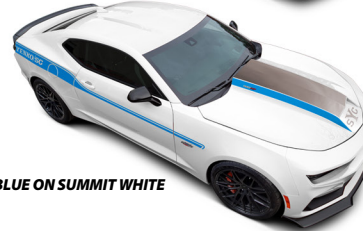
BLUE ON SUMMIT WHITE