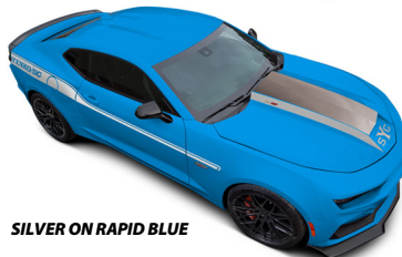
SILVER ON RAPID BLUE