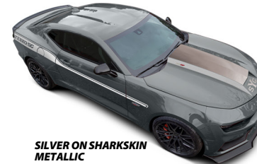
SILVER ON SHARKSKIN METALLIC