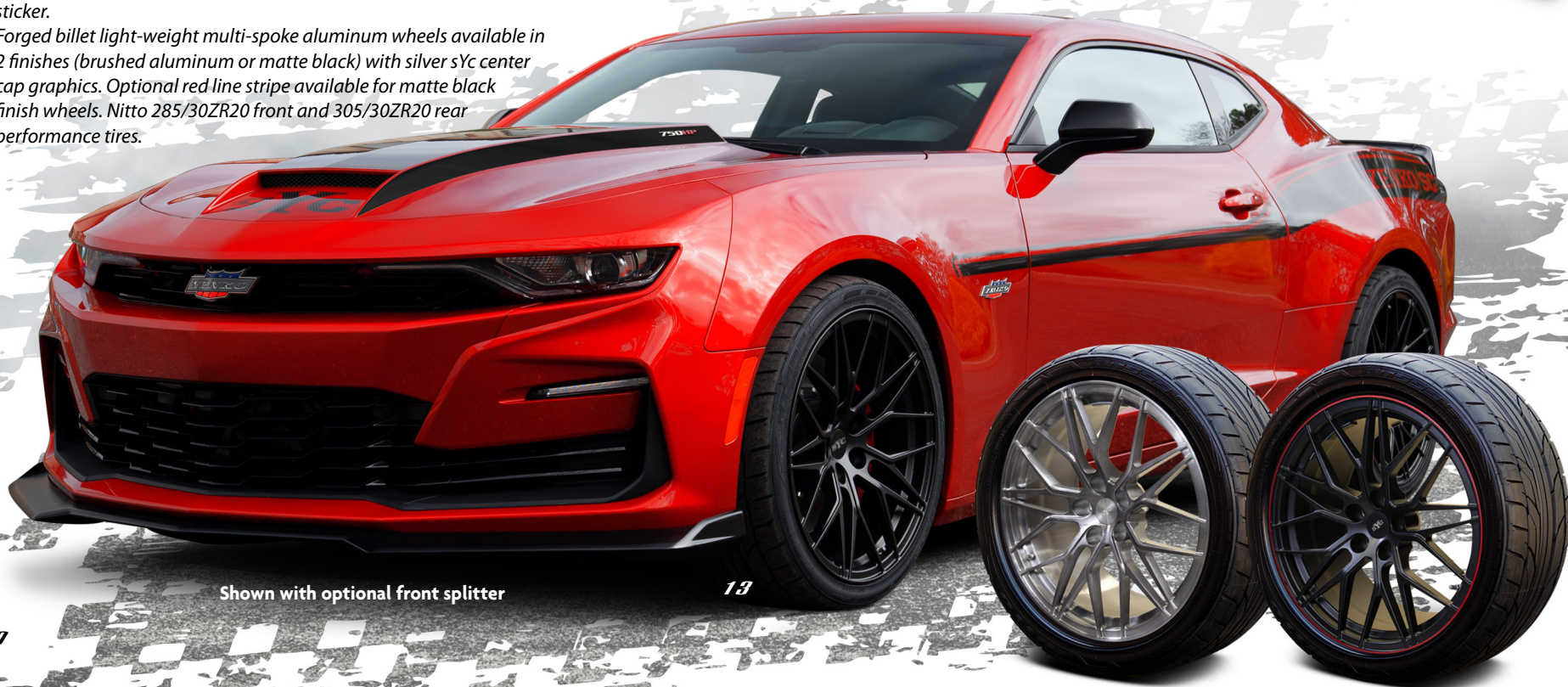
Shown with optional front splitter