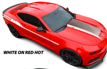
WHITE ON RED HOT

The optional Leather Seat Trim Package features black leather surround with leather inserts available in 6 colors plus black and white cloth houndstooth. Custom colors are available. The leather seats are accented by a choice of stitching in black, white, or colors to match the inserts. (Not available with 1LE option).