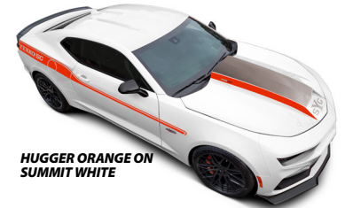
HUGGER ORANGE ON SUMMIT WHITE