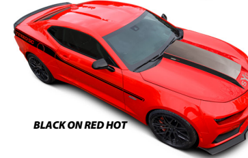
BLACK ON RED HOT