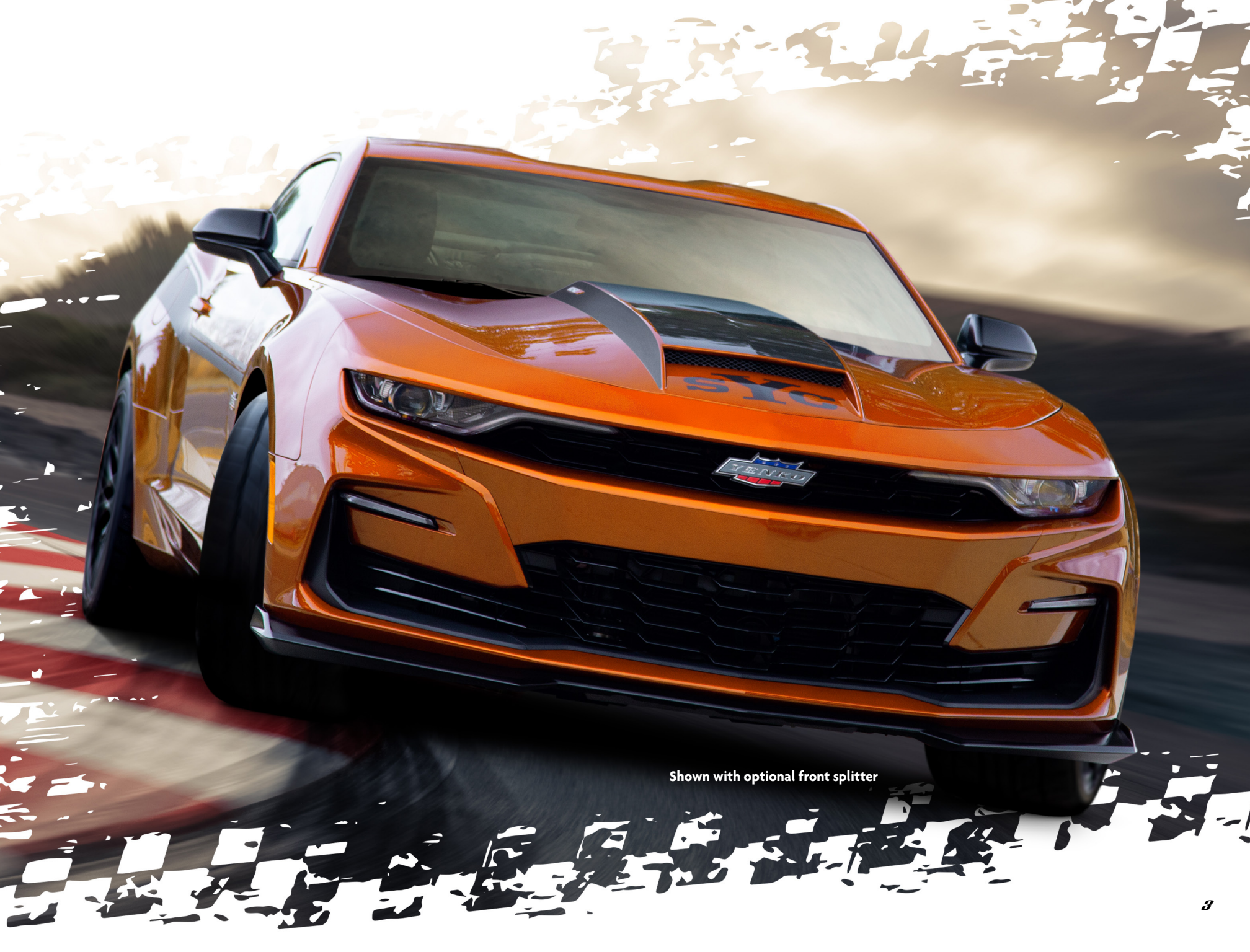
Shown with optional front splitter