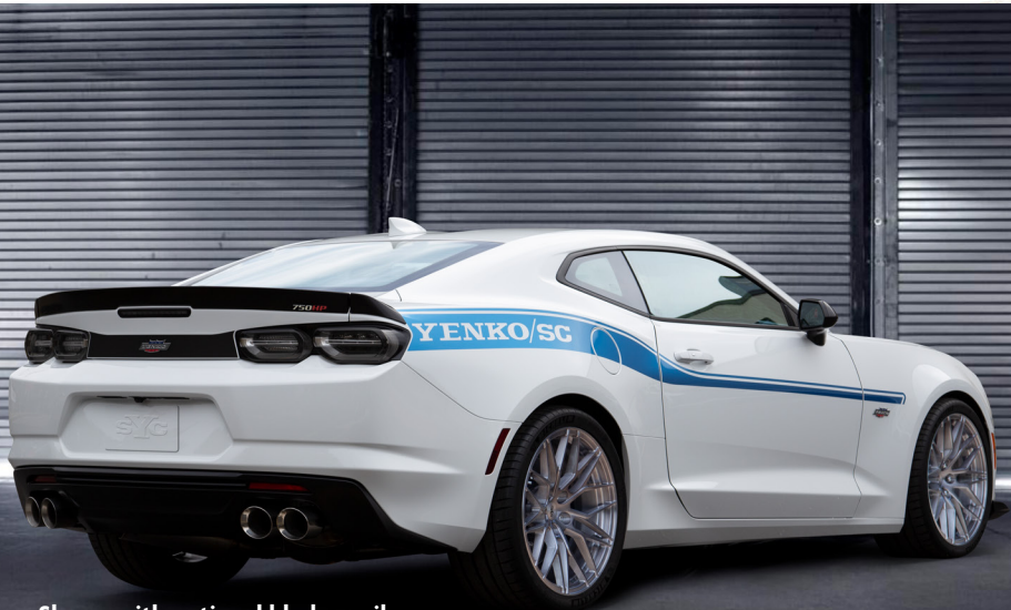
Shown with optional blade spoiler