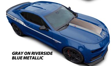
GRAY ON RIVERSIDE BLUE METALLIC