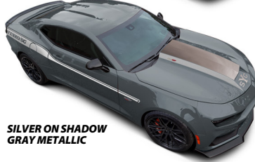
SILVER ON SHADOW GRAY METALLIC