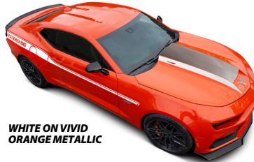
WHITE ON VIVID ORANGE METALLIC