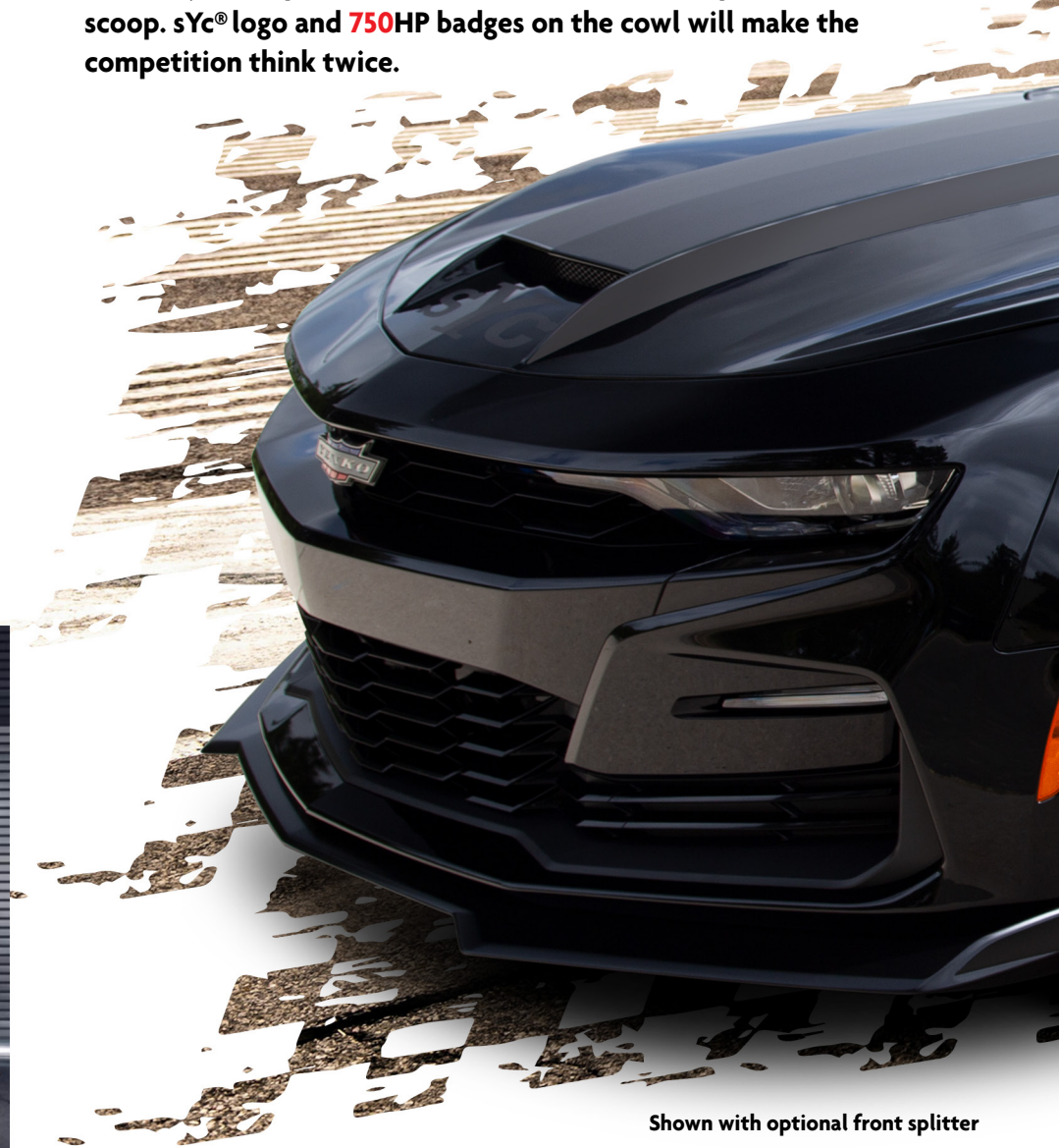
Shown with optional front splitter

The body color painted carbon fiber hood with exposed carbon fiber scoop. sYc® logo and 750HP badges on the cowl will make the competition think twice.