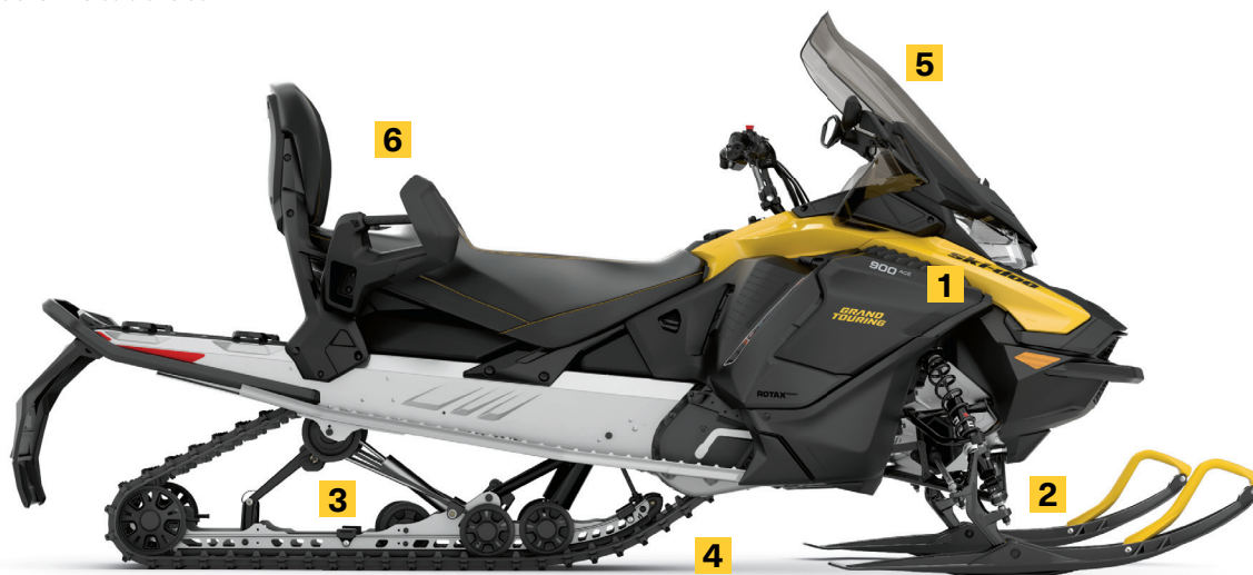
GRAND TOURING SPORT 900 ACE SHOWN

High-quality KYB 1 high-pressure gas shock for excellent performance and reliability.