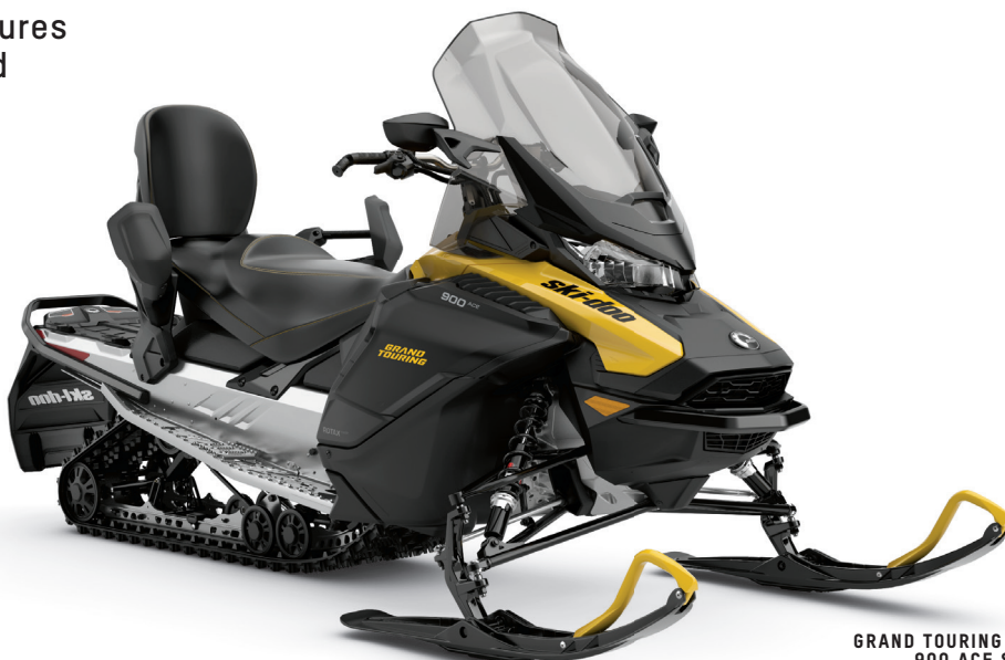
GRAND TOURING SPORT 900 ACE SHOWN

Trail comfort and 2-up features with precision handling and savvy style.