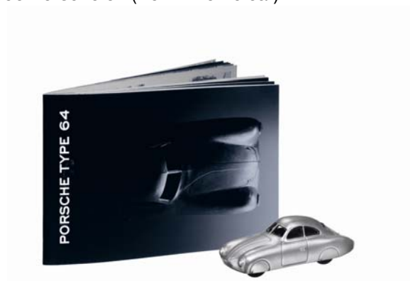
356 Porsche 64 (Berlin-Rome car)