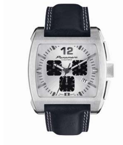
Panamera Chronograph, Limited Edition