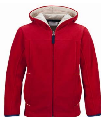
Children's fleece jacket