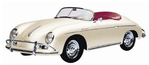
356 A Speedster (1957)