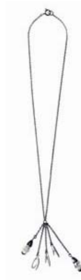
Necklace with Swarovski crystals