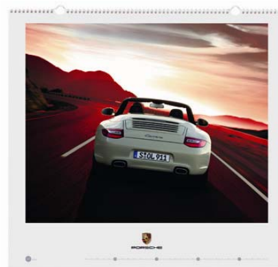
Porsche calendar "Driver's Perspective"