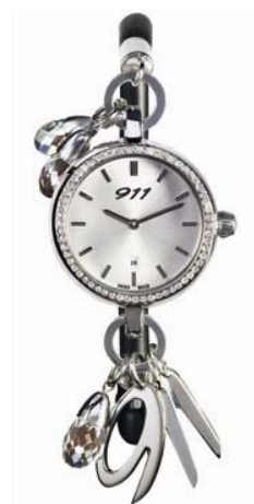
Jewelled watch with Swarovski crystals