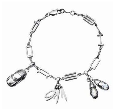
Bracelet with Swarovski crystals