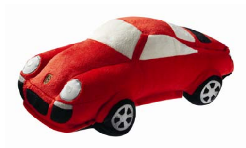
Plush 911 car