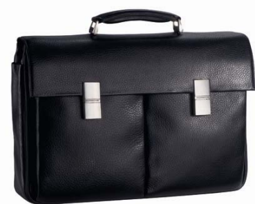
Sport Classic II briefcase M