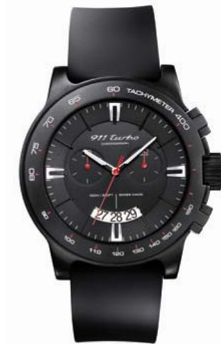
911 Turbo Sport Classic Chronograph