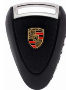
Porsche USB stick