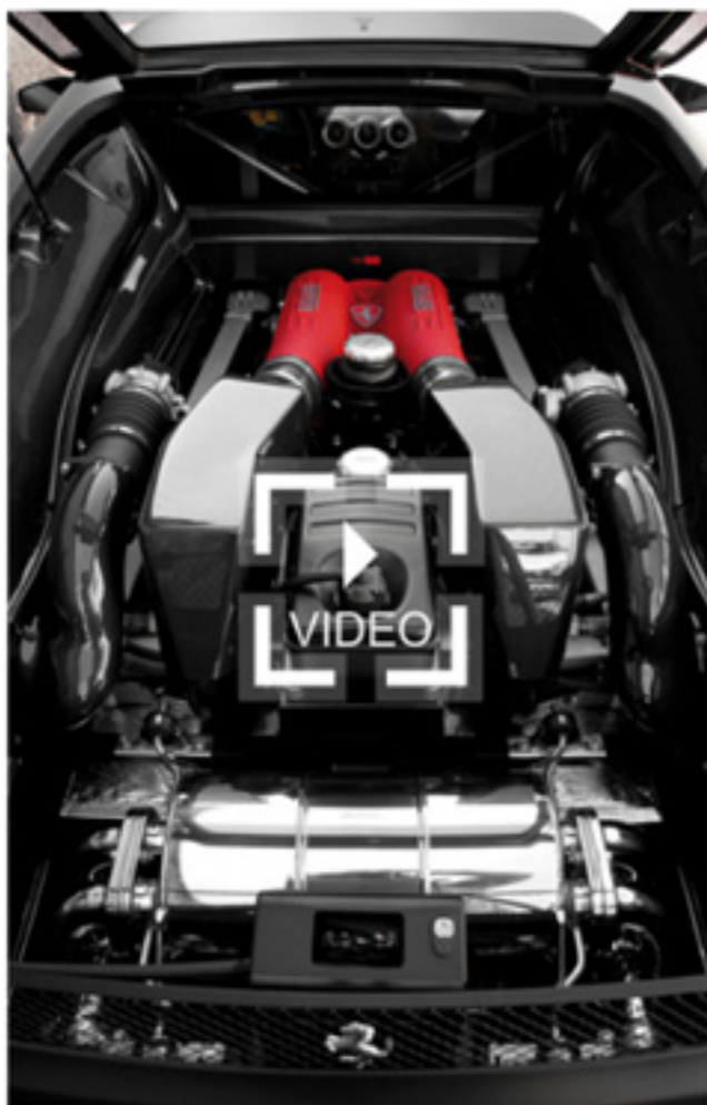
ENGINE | NOVITEC RACE Bi-compressor

The heart of the Novitec Rosso program is the development of performance engines. The various engine performance kits are a product of extensive research and development. These performance kits enjoy a very good reputation thanks to their power output, driving performance and durability. The installations are performed and completed by skilled NOVITEC technicians either at the Novitec headquarters in Germany or as a local installation worldwide through our worldwide service program.