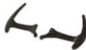
NOVITEC Shift lever F1

in carbon, long design (set) Article No.: F8 777 41