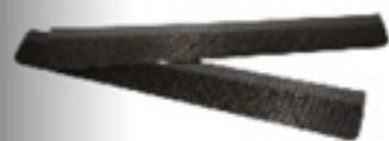
NOVITEC Foot board in carbon (set)