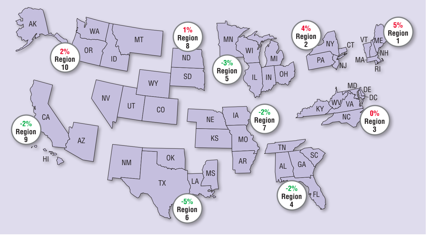
Sources: 2021 and 2022 statistical projections. Puerto Rico is not included in Region 2.