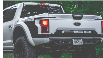
MSA Exterior Graphics & Badging Package

Matte Black MSA Inspired Grille & Emblem