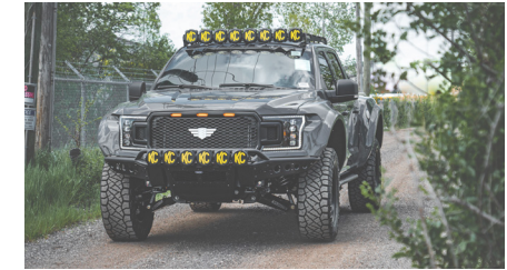
MSA Wide Body Exterior Baja Package

Wide body Front And Rear Fiberglass Body Panels, Panel Support Braces, Extended Wheel Well Fender Liners, Color Matched Exterior Widebody Panels