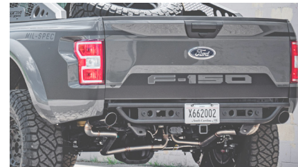
Dual Exhaust Tips with Black Finish

One Piece Heavy Duty Steel Construction, Welded For Extra Strength, Recessed LED Lighting Compatible, Satin Black Powder Coated Finish