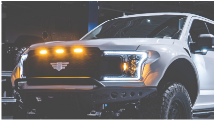
High Intensity LED Headlights