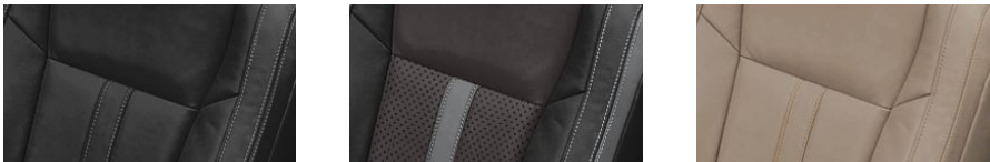
Black Grey Tan