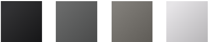
Agate Black Magnetic Grey Lead Foot Grey Oxford White