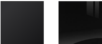
Matte Black Gloss Black