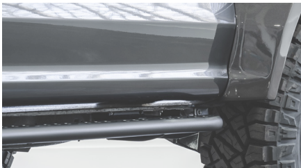
Powder Coated, Textured, Heavy Duty Side Steps

Wide body Front And Rear Fiberglass Body Panels, Panel Support Braces, Extended Wheel Well Fender Liners, Color Matched Exterior Widebody Panels