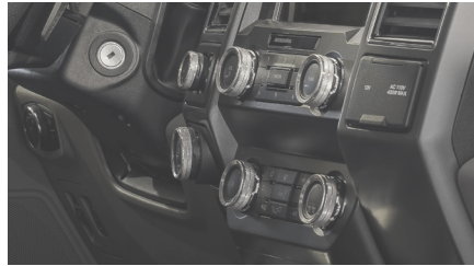
Billet Aluminum Control Knobs

Magnesium Paddle Shifters, Centerline Stitch & Aggressive Sport Design