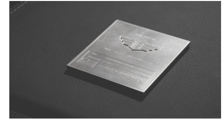
Billet Number Plaque