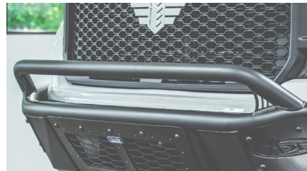
Front & Rear Bumpers

One Piece Heavy Duty Steel Construction, Welded For Extra Strength, Recessed LED Lighting Compatible, Satin Black Powder Coated Finish