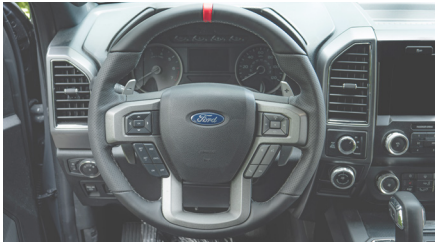
Performance Steering Wheel Upgrade

Magnesium Paddle Shifters, Centerline Stitch & Aggressive Sport Design