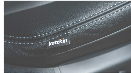
Leather Seat Upgrade