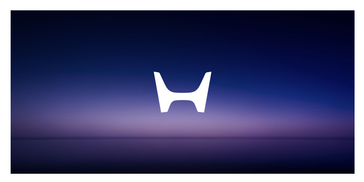
Honda press conference at CES 2024 (livestreaming/archive) https://www.youtube.com/watch?v=jYdfi_zkQDQ

The current "H mark" has a long history, dating back to 1981 when it was renewed from the previous version. To commemorate the development of the next-generation EVs, Honda decided to design a new H mark, which represents Honda automobiles, to express Honda's determination to pursue the transformation as well as Honda's corporate attitude of going beyond the origin of Honda and constantly pursuing new challenges and advancements. This design expression, like two outstretched hands, represents Honda's commitment to augment the possibilities of mobility and sincerely serve the needs of the users of Honda EVs. This new H mark will be used on next-generation EVs of Honda, including Honda 0 Series models.