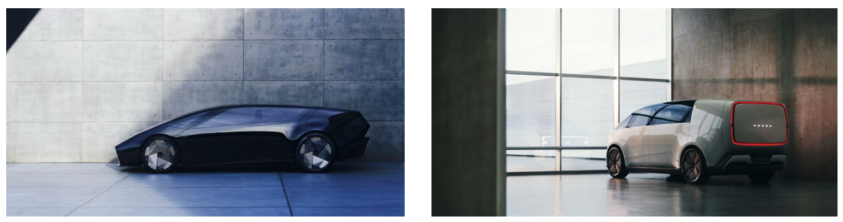
Honda 0 Series concept models, Saloon (left) and Space-Hub (right)

TOKYO, Japan, January 10, 2024 – Honda today unveiled the " Honda 0 Series ," a new EV series Honda will launch globally starting in 2026, with the world premiere of two concept models, namely Saloon and Space-Hub , at the CES 2024 in Las Vegas, Nevada, U.S. Honda also presented the world premiere of the new H mark to be used exclusively for the next-generation EV models of Honda.