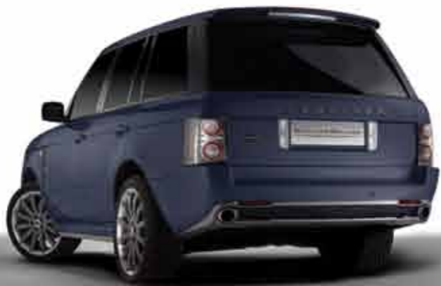
Gulf Blue Metallic