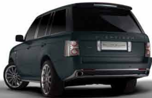
Holland and Holland Green Metallic