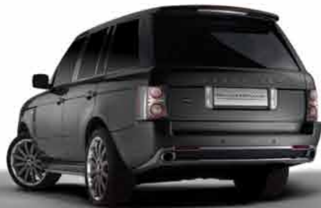
Santorini Black Metallic