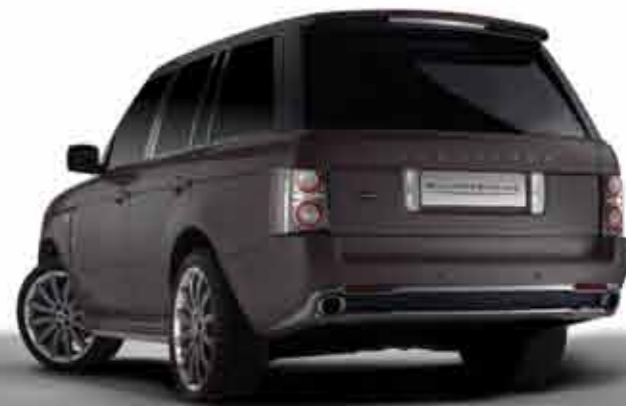
Berberis Aubergine Metallic

* The colours presented above are for representation purposes only.