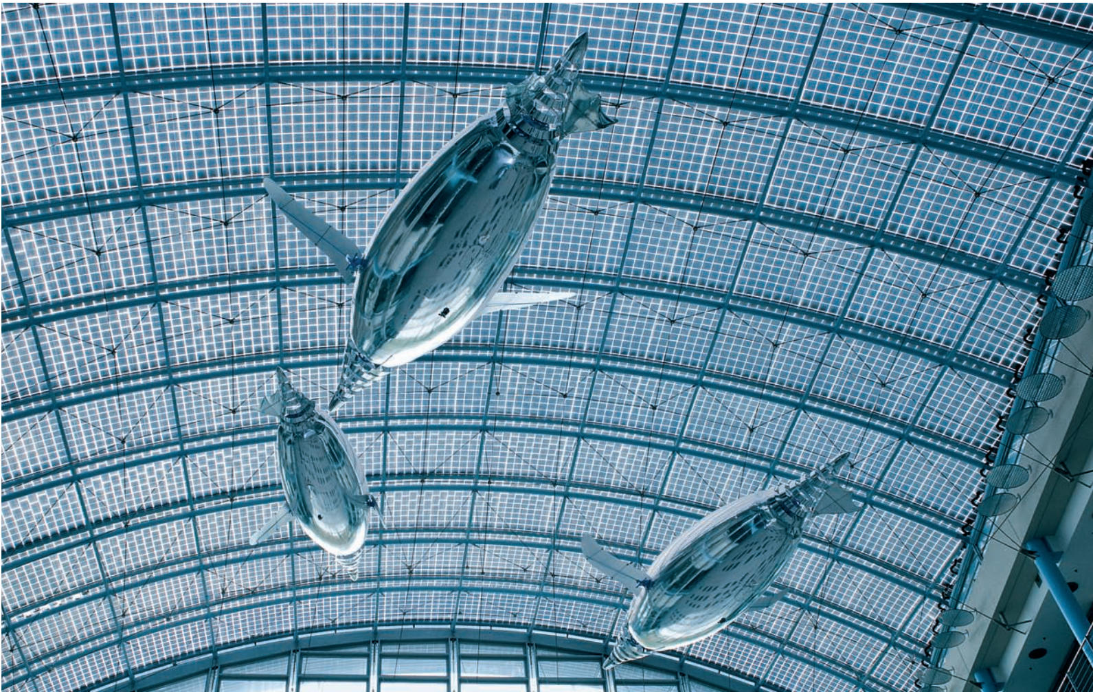
A group of autonomously flying penguins