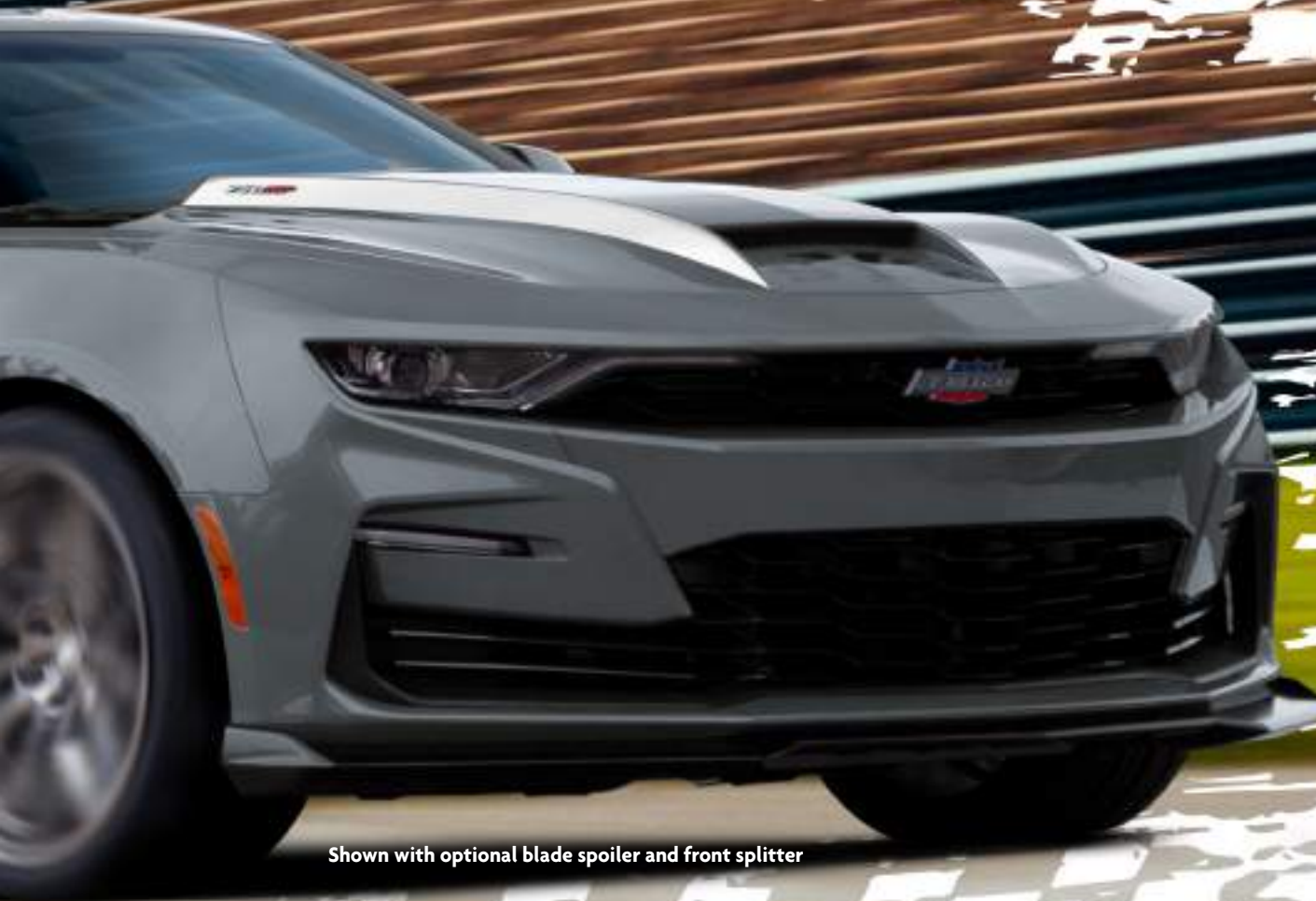
Shown with optional blade spoiler and front splitter