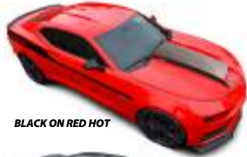
BLACK ON RED HOT

With 11 factory paint color choices, and 9 colors plus optional carbon fiber available for the sYc® side and hood scoop cowl graphics, you can personalize your 2024 YENKO/SC® Camaro so it's really unique and more collectible. Custom graphic colors are also available and the same color can be added to the brake calipers and supercharger (optional). All of our graphics are made from OE-quality, UV resistant vinyl that won't fade, crack, or peel.