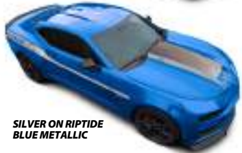
SILVER ON RIPTIDE BLUE METALLIC