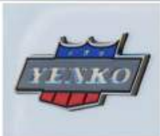
YENKO® Crest badges for front grille, fenders, and rear panel.