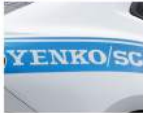
YENKO/SC® body side stripes.