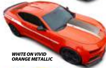
WHITE ON VIVID ORANGE METALLIC