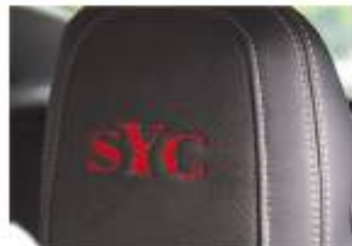
sYc® embroidered front seat headrests.