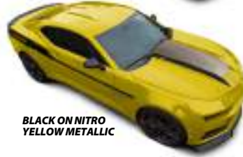
BLACK ON NITRO YELLOW METALLIC