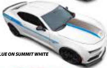
BLUE ON SUMMIT WHITE