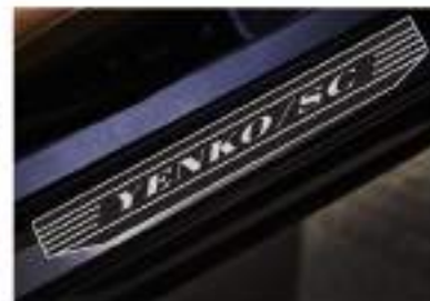
YENKO/SC® doorsill plates.