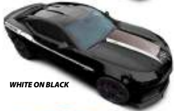
WHITE ON BLACK