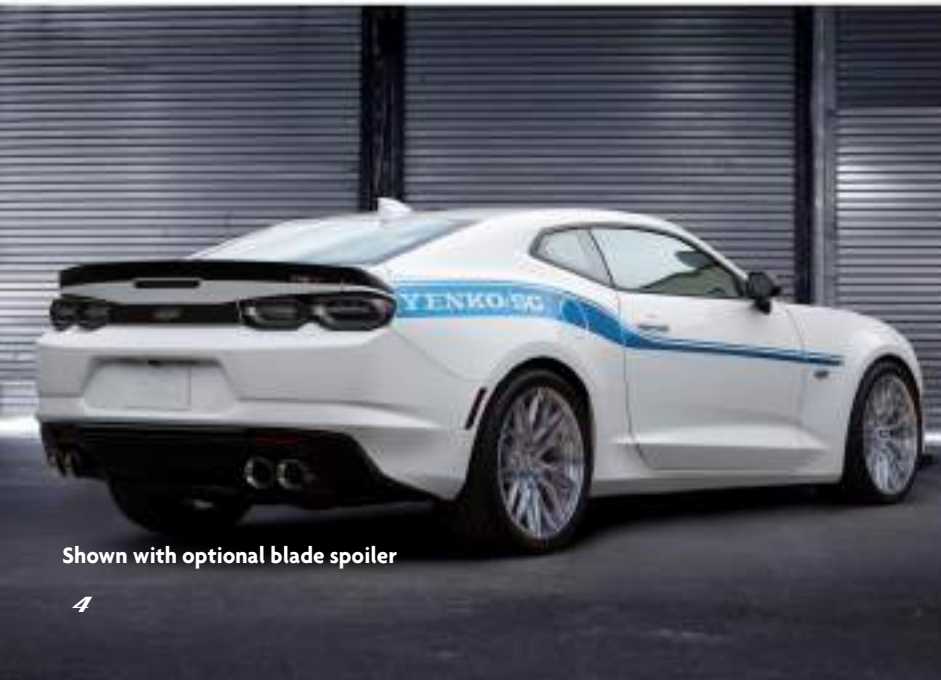
Shown with optional blade spoiler