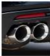
High-polished, dual dual stainless steel exhaust tips.