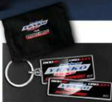
YENKO® Crest key fobs and sequentially numbered power badge (1-50 Stage I & II, 1-100 Stage III) and YENKO® Crest embroidered portfolio.