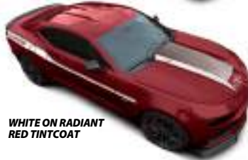
WHITE ON RADIANT RED TINTCOAT