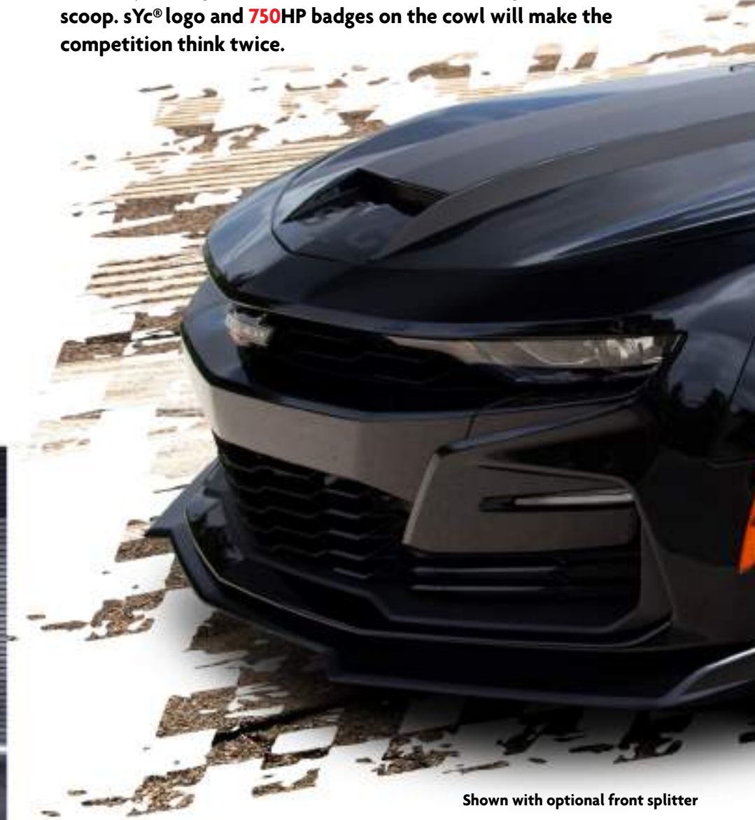
Shown with optional front splitter

The body color painted carbon fiber hood with exposed carbon fiber scoop. sYc® logo and 750HP badges on the cowl will make the competition think twice.