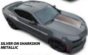
SILVER ON SHARKSKIN METALLIC