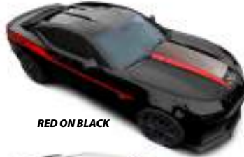
RED ON BLACK