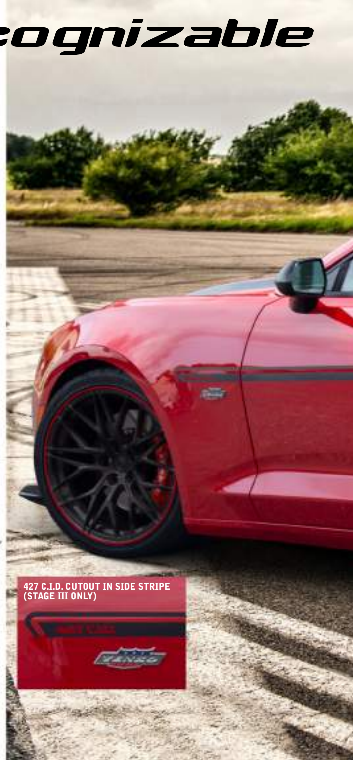
427 C.I.D. CUTOUT IN SIDE STRIPE (STAGE III ONLY)