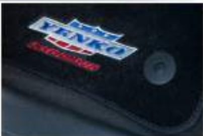
YENKO® Crest Supercharged embroidered premium front floormats.