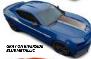
GRAY ON RIVERSIDE BLUE METALLIC