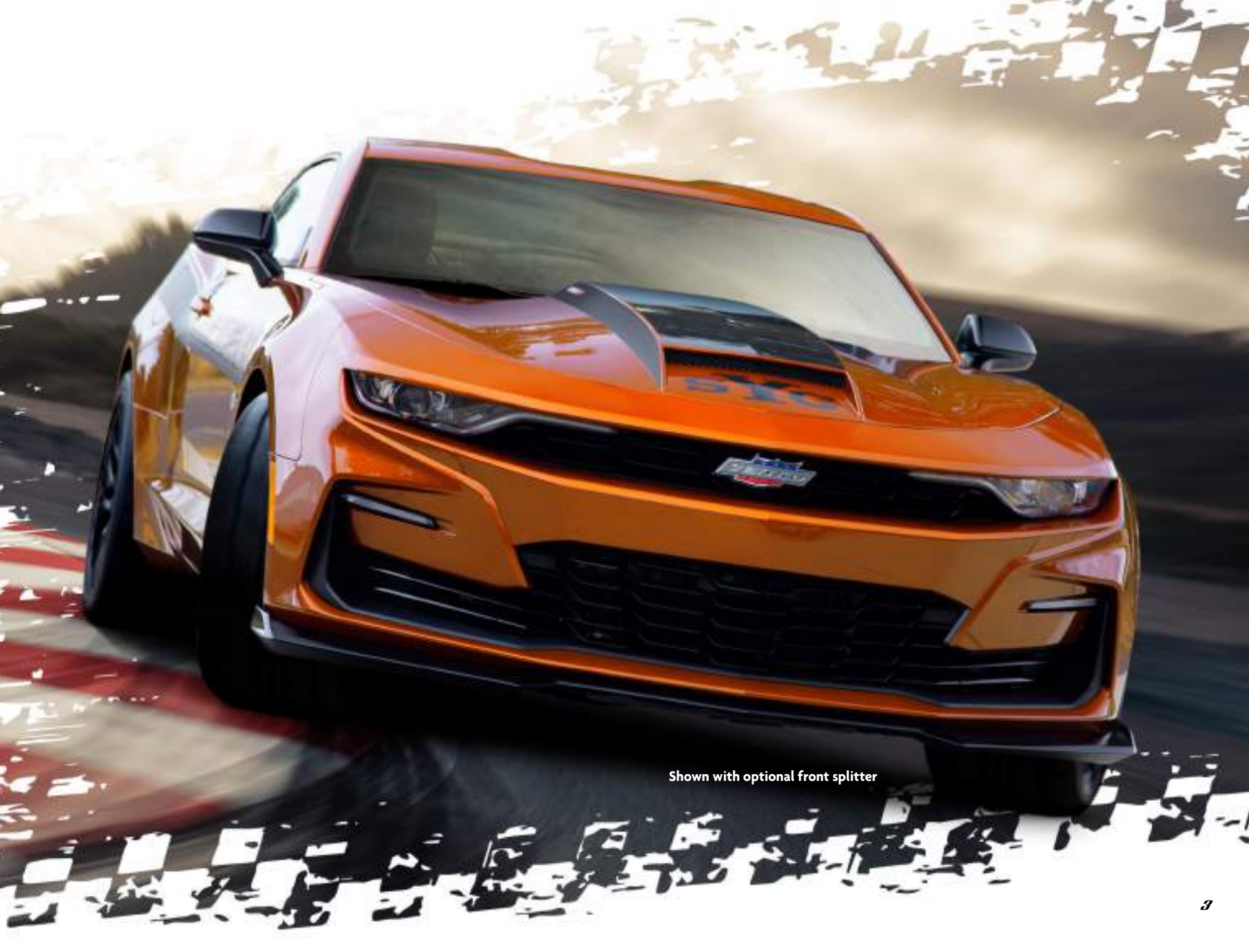
Shown with optional front splitter