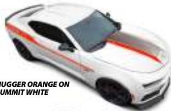
HUGGER ORANGE ON SUMMIT WHITE