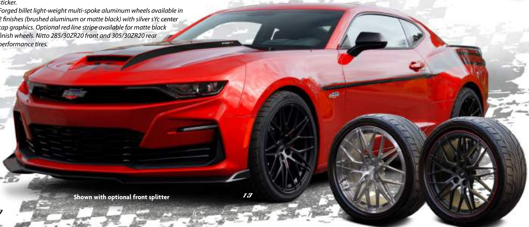
Shown with optional front splitter