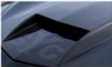
Body color painted carbon fiber hood with exposed carbon fiber scoop.