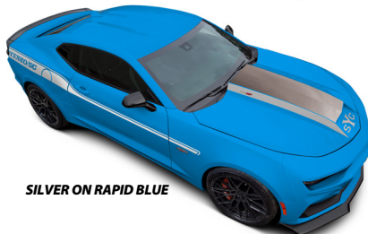
SILVER ON RAPID BLUE