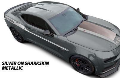
SILVER ON SHARKSKIN METALLIC