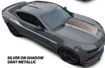
SILVER ON SHADOW GRAY METALLIC