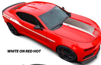
WHITE ON RED HOT

crest badges and unique side stripes give the exterior an instantly recognizable appearance. The interior also displays the YENKO® trademark with embroidered floor mats, headrest logos and a YENKO® crest power badge.