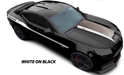
WHITE ON BLACK