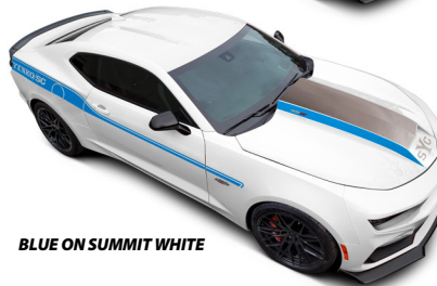
BLUE ON SUMMIT WHITE