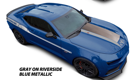
GRAY ON RIVERSIDE BLUE METALLIC