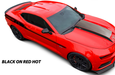
BLACK ON RED HOT