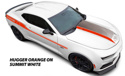
HUGGER ORANGE ON SUMMIT WHITE