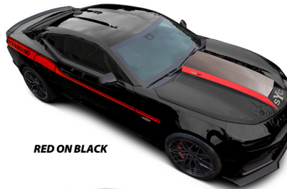
RED ON BLACK