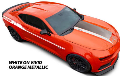
WHITE ON VIVID ORANGE METALLIC