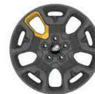
17" machined-face Dark Tarnish-painted aluminum with Tremor Orange-painted pocket Included on Tremor Off-Road (17V) and Tremor Appearance Package (17C)