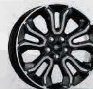
18" black-painted aluminum (64B; Hybrid only) Optional on LARIAT