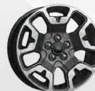
17" machined-face Carbonized Gray-painted aluminum (64V) Optional on LARIAT