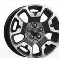
17" machined-face Carbonized Gray-painted aluminum (64V) Optional on XLT