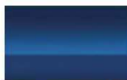
Atlas Blue Metallic – NEW