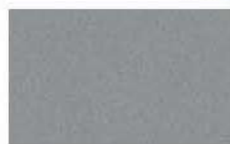
Iconic Silver Metallic