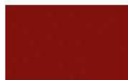
Hot Pepper Red Metallic Tinted Clearcoat (1)