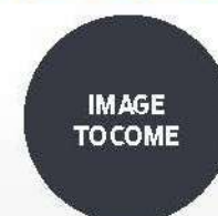
18" machined-face Ebony-painted aluminum Included in Black Appearance Package (59D)

NOTE: See latest 2023 Maverick Dealer Ordering Guide for the most up-to-date feature availability and restriction information.