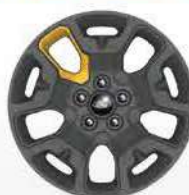
17" machined-face Dark Tarnish-painted aluminum with Tremor Orange-painted pocket Included on Tremor Off-Road (17V) and Tremor Appearance Package (17C)