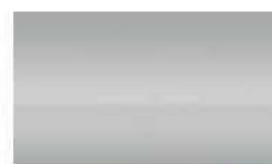
Avalanche Gray – NEW Tremor Exclusive