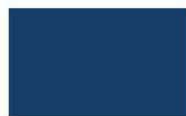
Alto Blue Metallic Tinted Clearcoat (1)