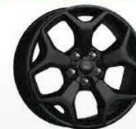
17" black-painted aluminum (641) Requires FX4 Off-Road Package (17S)