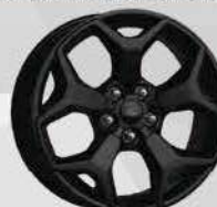
18" black-painted aluminum (64I) Requires FX4 Off-Road Package (17S)