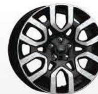
18" machined-face bright aluminum Standard on LARIAT