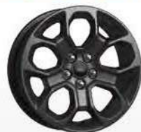
17" Carbonized Gray-painted aluminum Standard on XLT