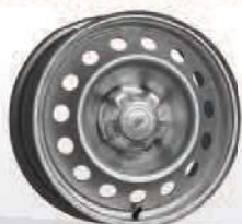
17" Sparkle Silver-painted steel Standard on XL