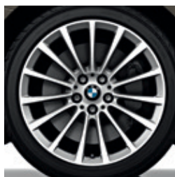
18" Multi-spoke style 619