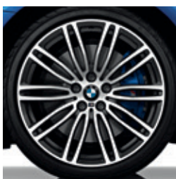
19" M Double-spoke style 664 M