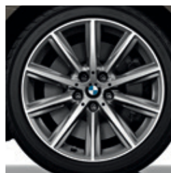
18" V-spoke style 684