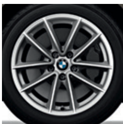
17" V-spoke style 618