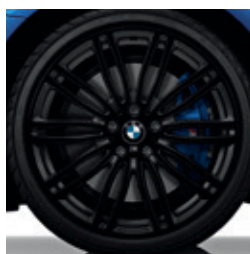
19" M Double-spoke style 664 M, Black