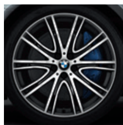
20" BMW Individual V-spoke style 759 I