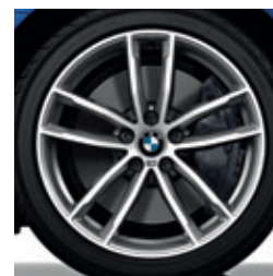
18" M Double-spoke style 662 M