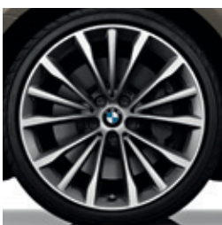
19" W-spoke style 663, Bi-colour